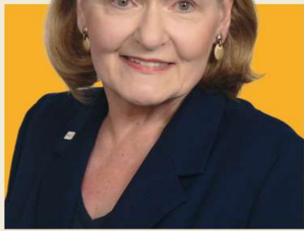
Rtn. Stephanie Urchick Rotary International President